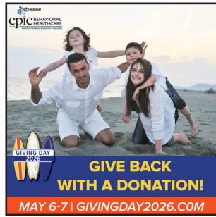
Post family at the beach