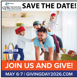
Father with 3 kids