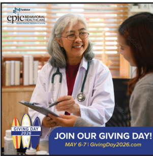
post image: Stigma image

#Milkandcookies#StAugustine #givingday2026 #epicbehavioralhealthcare