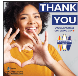
Thank you post woman with heart hands

#Milkandcookies#StAugustine #givingday2026 #epicbehavioralhealthcare