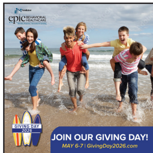
Post #1 Image: teens at the beach

#Milkandcookies#StAugustine #givingday2026 #epicbehavioralhealthcare