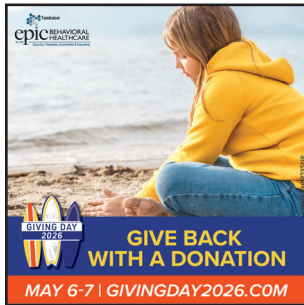
Post #1 Image: Girl at beach

#Milkandcookies#StAugustine #givingday2026 #epicbehavioralhealthcare